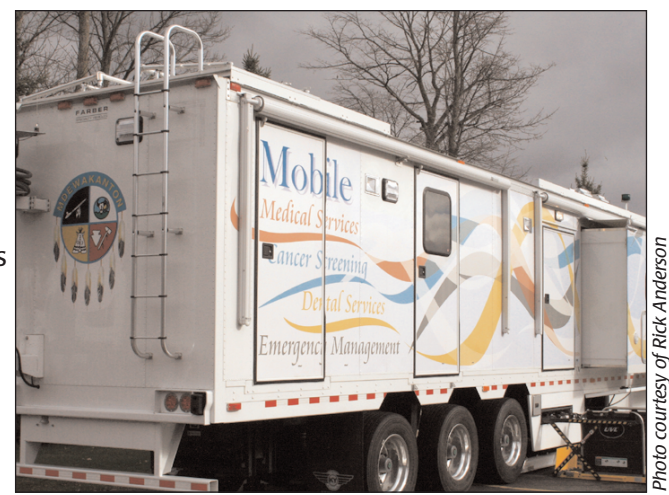
Shakopee Mdewakanton Sioux Community's mobile medical unit staff performed mammograms for Mille Lacs Band community members on November 7.

We are grateful to the Shakopee Mdewakanton Sioux Community for allowing the Mille Lacs Band to be the first tribe to be visited by the mobile unit. We look forward to having them visit us again.