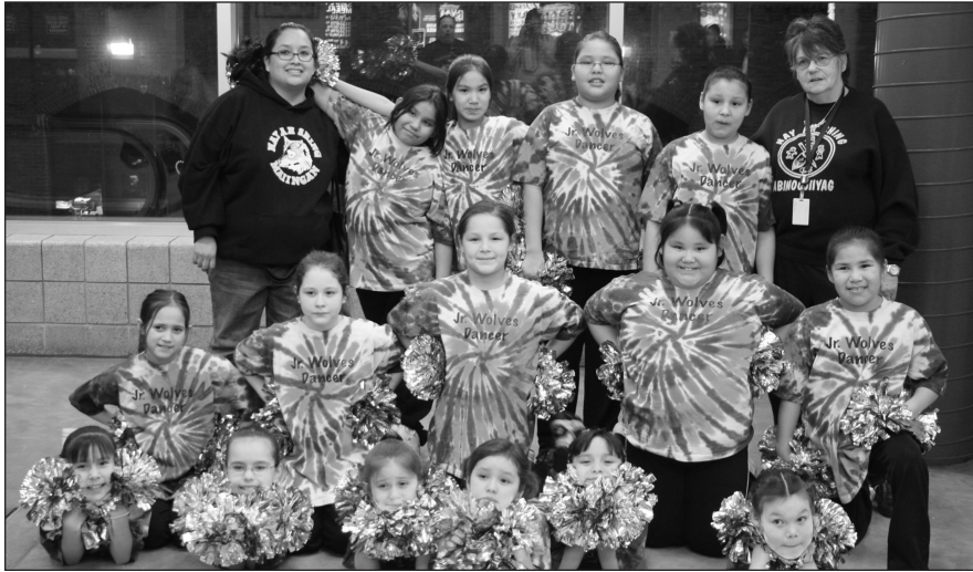
Nay Ah Shing cheerleaders perform a halftime routine with the Timberwolves Dance Team at the February 11 game.