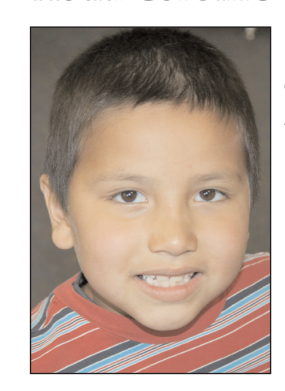
"Math and adding numbers."