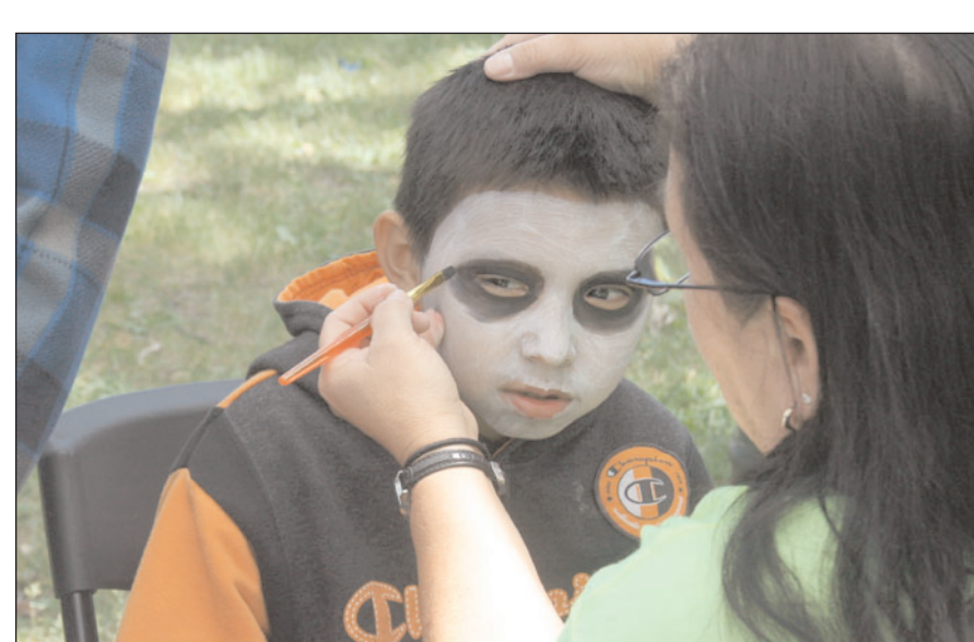
Urban Band members enjoyed the day filled with fun, food and face painting.