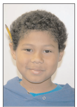
"Math games – addition and multiplication, and fishing."