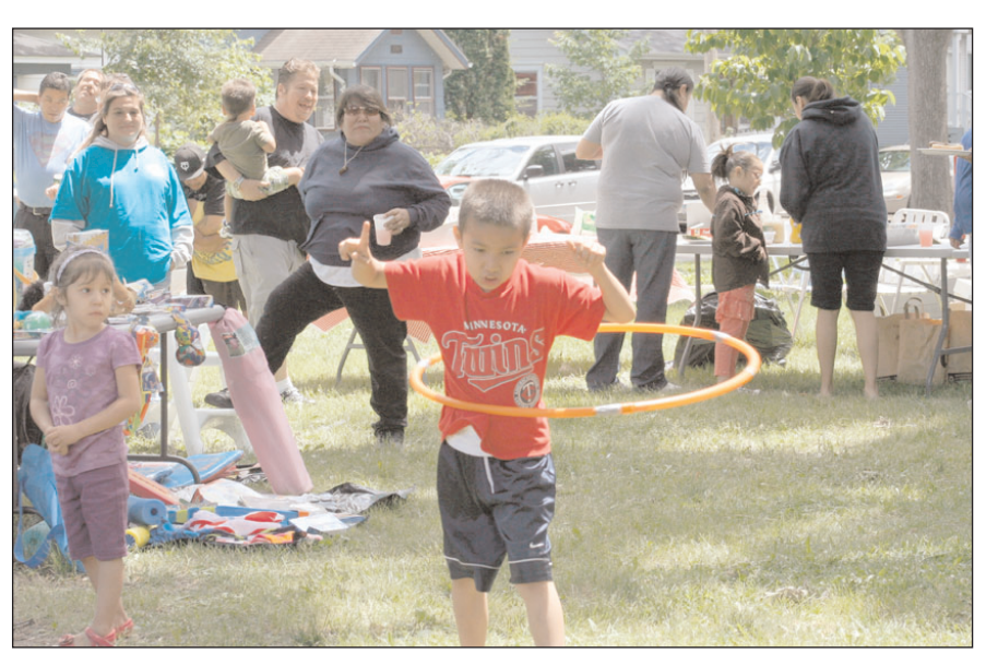
The 12th annual urban end-of-the-school-year picnic and community celebration was held on Saturday, June 11, at Brackett Park in Minneapolis. There were multiple contests for the youth including hula-hooping.