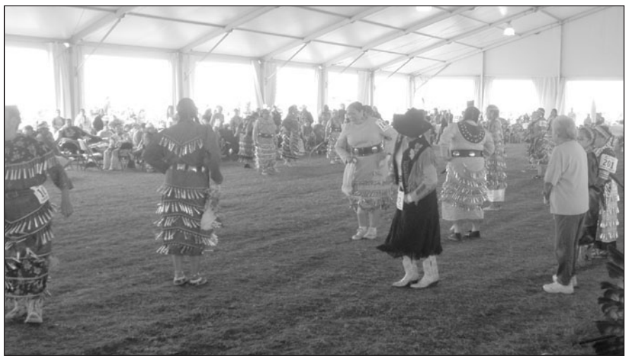
The women's jingle dress, which originated on the Mille Lacs reservation, is a favorite category to watch during the powwow.