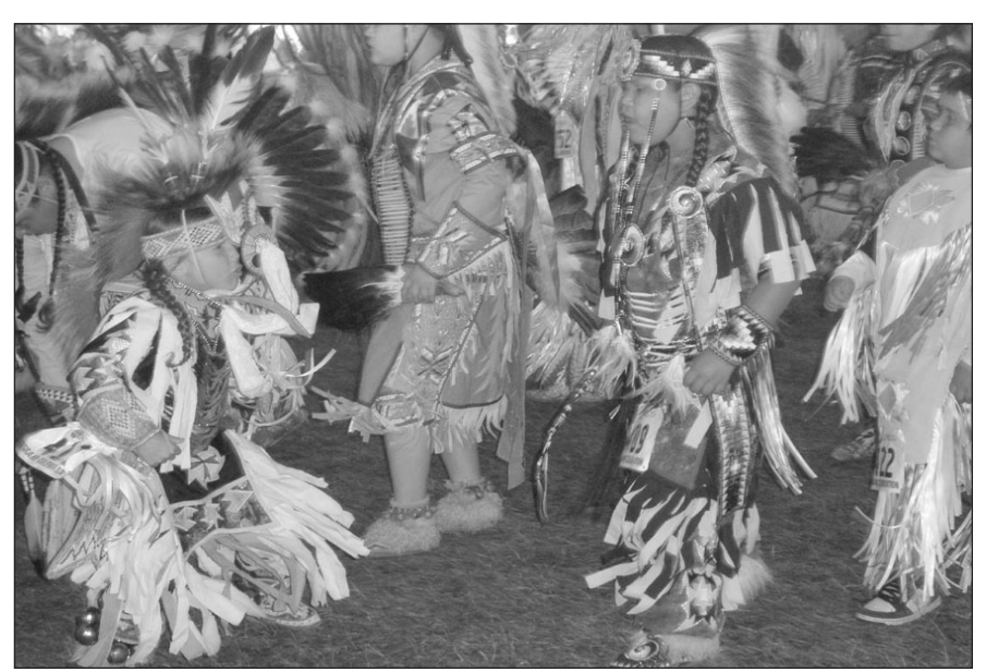
Hundreds of Native American dancers from around the country and Canada gathered for the 2011 Grand Celebration Powwow. Shown here are boys' grassdancers