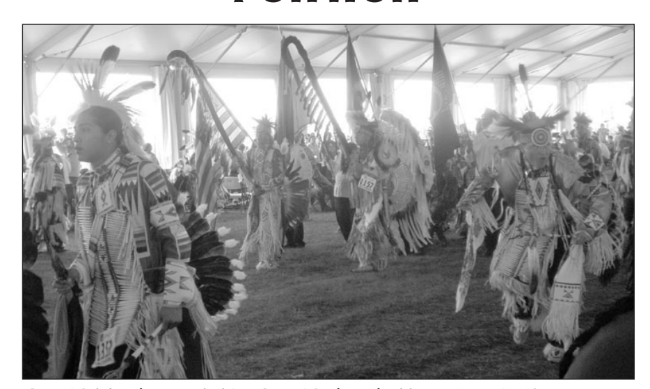
Grand Celebration was held at Grand Casino Hinckley on June 17-19.