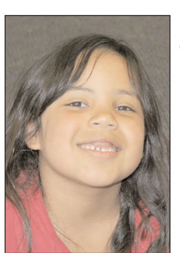
"Reading and learning the stories."