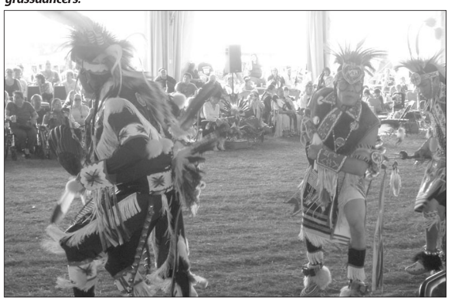
Grand Celebration Powwow featured more than 30 dance competitions, including men's traditional dancers (shown above). This event is one of the largest competition powwows in the nation.