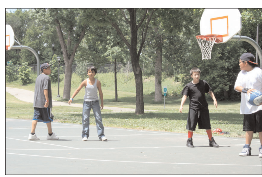
Young\ Band\ members\ couldn't\ stay\ off\ the\ basketball\ courts\ while\ at\ the\ park.