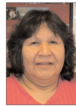
"I will watch soaps and relax."