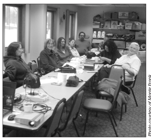
Band members and employees participated in a first responder course to be trained in trauma response, CPR, defibrillator use, patient stabilization, and other basic emergency preparedness skills.