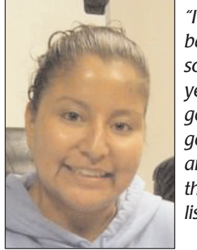
"I'm going back to school this year, so my goal is to get good grades and make the dean's list."