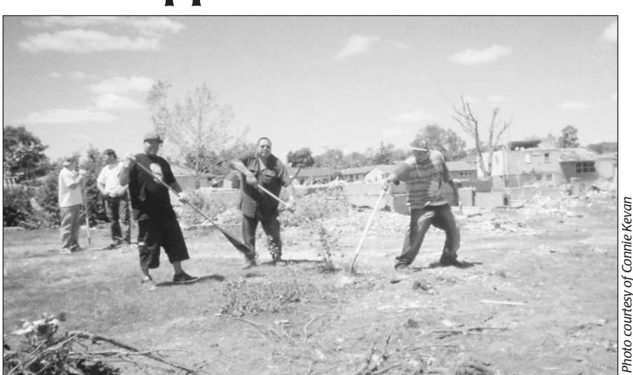
After the tornado in June, 20 Band members traveled to Wadena to help with the cleanup efforts. These Band members are part of the Day Labor Pool Program.