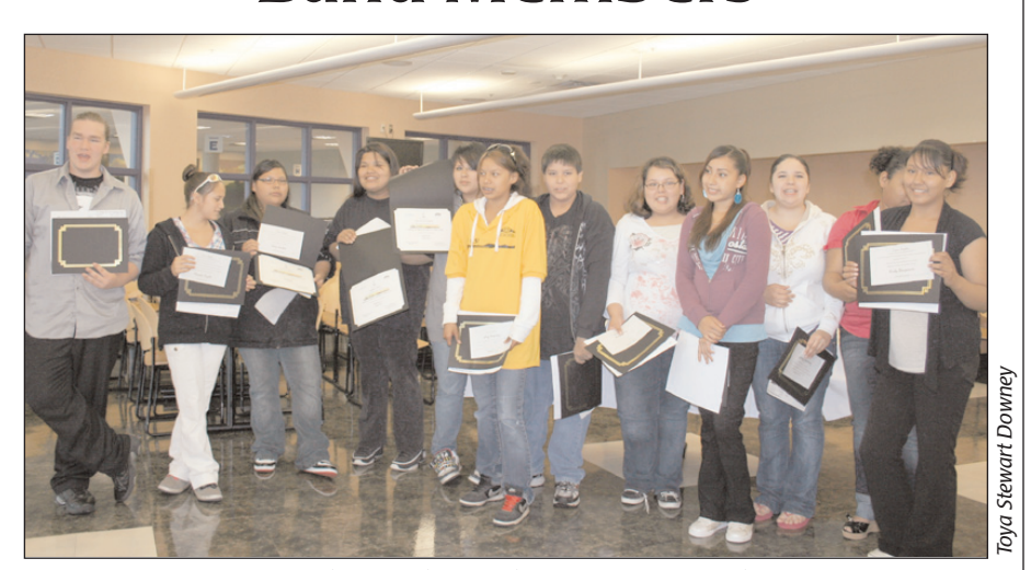
The week-long Yes! American Indian Business Leader Camp included 15 Nay Ah Shing students who met influential leaders, learned about operating a business, created business plans, and explored their dreams of business ownership.