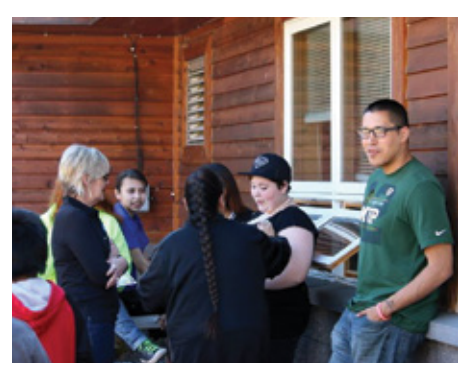
Over 70 young adults were present for the prevention awareness activities.