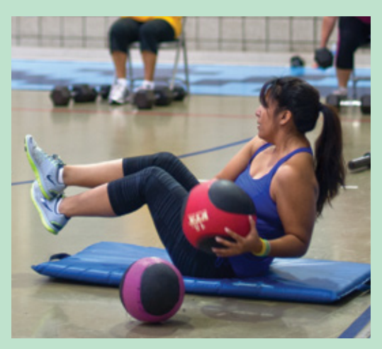
Set a realistic goal. Make sure your goal is achievable and sustainable.

Year after year weight loss tops the list of New Year's resolutions. Gym memberships increase, exercise equipment is purchased and healthier foods land in the grocery cart. Eventually the gym is less crowded, the exercise equipment gathers dust in a corner and the grocery cart has fewer fruits and vegetables. The list of reasons not to exercise and eat healthy seems to get longer and longer as each