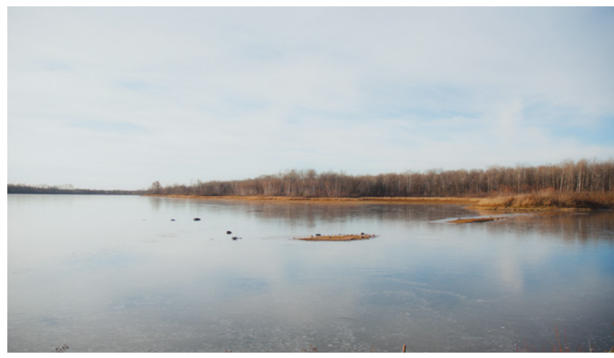
The restoration of the 100-acre lake has been a top Mille Lacs Band priority since 2012.