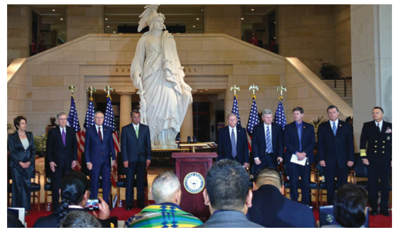
Members of Congress presented medals to award recipients, their families, and tribal leaders in Washington D.C.