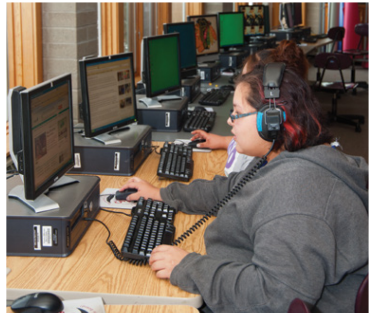
An innovative online curriculum allows students to complete many of their high school courses from behind a computer.

For some students at Nay Ah Shing School, however, a standard school environment doesn't work. That is why the new computerized curriculum was adopted, featuring the same standards set by the state education department. Students can do assignments at school, home, or both. Ultimately they have to pass the same standardized tests as all Minnesota students in order to graduate.