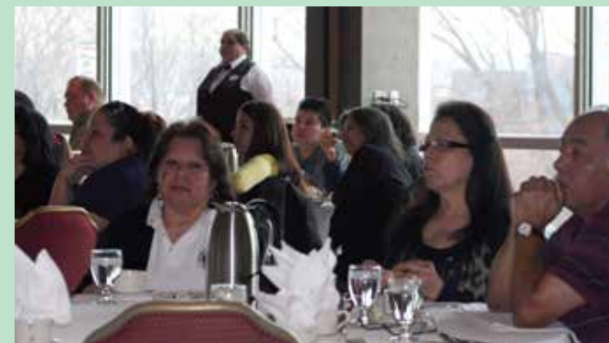
Urban Area Band members